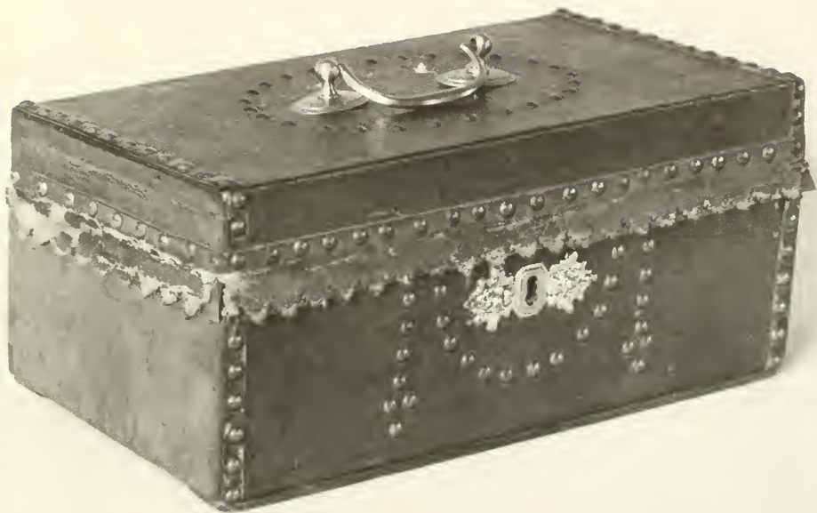
Trunk by James Roche; leather; Baltimore, Md.; c. 1825. HOA 5"; WOA 11 \frac{3}{4} "; DOA 6 \frac{1}{2} ". Private collection.